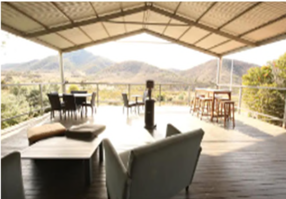
Pichi Richi campsite QUORN SA