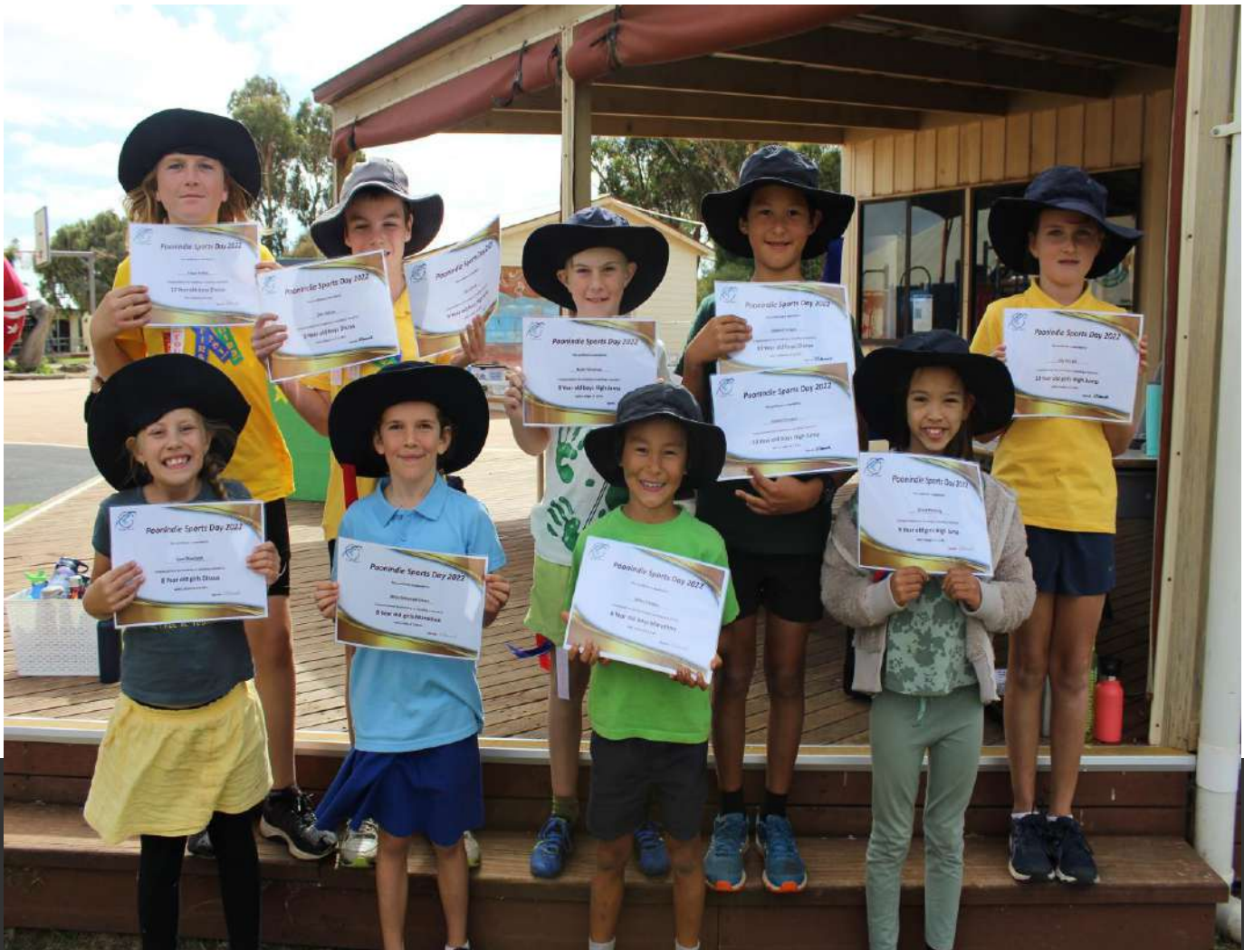
2022 Record Breakers