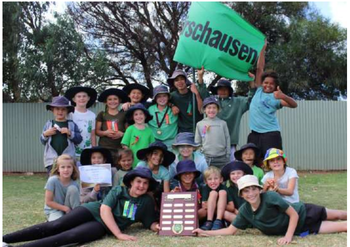
Hirschausen 2022 Winning House Team