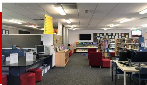
Reorganised Library Area!