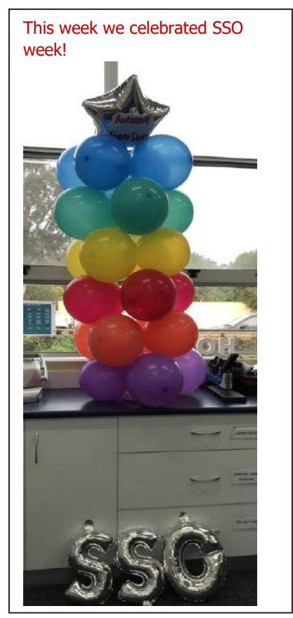
This week we celebrated SSO week!

Many parents are still unsure if they are allowed to enter the site. We have been instructed to continue to minimise the amount of parents/ adult traffic onsite, however we do recognise there are times that parents would like to make contact with teachers. Please wear a mask if you enter school grounds to catch up with a teacher in person. We certainly don't advise that parents gather in groups on the school grounds. Thank you for your understanding and appreciation that these are the guidelines that we have been asked to implement and follow which are no different to entering other schools, local businesses including supermarkets. Parents are certainly allowed to come to our school assemblies which are coming up in week 6 and 9 of term. Social distancing and masks for adults and we are good to go!!!